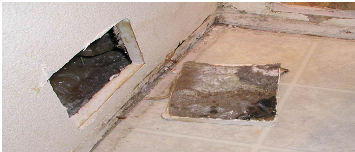
Figure 12. Saturated wallboard must be aggressively dried or mold WILL grow, often on the hidden paper backside of the wallboard in the wall cavity. This moldy wallboard should be carefully abated using a negative pressure enclosure and respiratory protection for workers.

Here is an example of missed moisture following a plumbing leak: Let's say a hot water tank leaks and soaks surrounding carpet for a couple days before it gets noticed. The landlord gets the water heater replaced and, in good faith, authorizes aggressive drying of the carpet and pad. But the adjacent drywall has wicked up some moisture that can't be obviously noticed without a moisture-sensing meter (Figure 11). Saturated drywall WILL get moldy (Figure 12). The best solution for do-it-yourselfers is to use a moisture meter to test the walls and ensure they are below 16 percent or so. Above 18 percent moisture content, drywall will typically support mold growth.