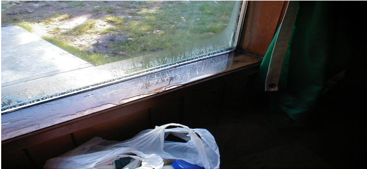
Figure 2. Too much moisture in the air (high relative humidity) leads to unwanted condensation on cool surfaces like double pane windows in cold weather. The moisture drips down, accumulates on sills, and can leak into wall cavities below causing hidden mold growth on wood and paper backed wallboard. Single pane windows will be colder still, resulting in condensation even with normal indoor humidity levels (below 40%) and may require daily drying of sills with towels to prevent mold growth and water damage.