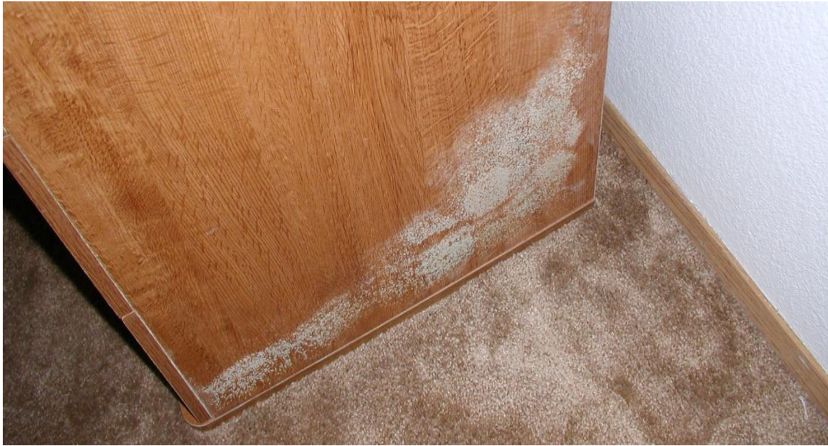
Figure 3. Mold growth caused by condensation on the cool cabinet placed against an exterior wall in a rental unit. The excessive indoor relative humidity (regularly exceeding 60%) was the culprit. This surface can be cleaned with soapy water.