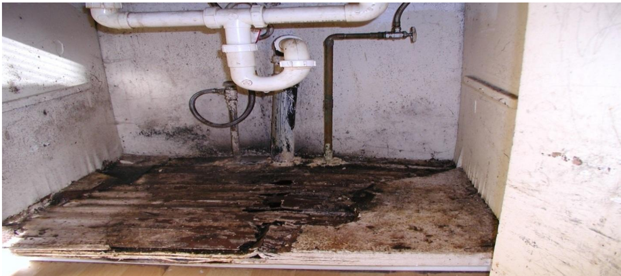
Figure 9. Plumbing leak: Prompt communication with a landlord could have prevented this damage.

Leaks are generally the landlord's responsibility. Of course the landlord typically won't know about a new leak unless informed by the tenant. The sooner a tenant notifies the landlord of a leak, the less likely surfaces will stay wet long enough to grow mold. Mold can get started in a couple days, so, you know, don't delay. We won't discuss fixing the source of leaks; just emphasize the hazards of delaying response to leaks.