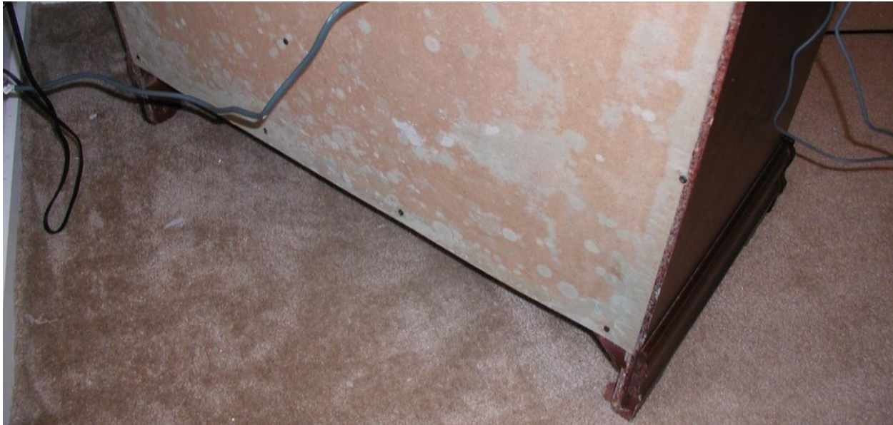
Figure 4. Condensation: Tenants kept the apartment at 60 degrees, cold enough that the back side of their dresser was below “dew point”, the temperature at which typical moisture levels in the air will condense on a surface. With the dresser chronically wet, mold got started and amplified. This can probably be scrubbed off (outside!) and painted. To prevent a recurrence of the mold, surfaces need to be kept warmer either by increasing the apartment temperature and/or allowing air circulation behind the dresser, or lowering the relative humidity in this space.