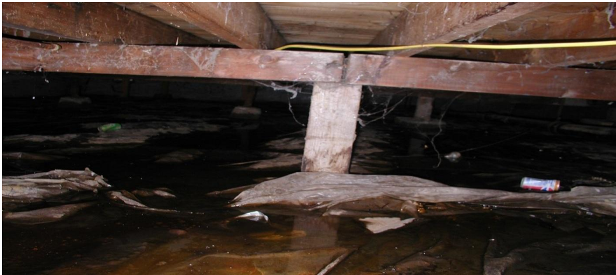
Figure 7. Standing water in a crawlspace: 40 percent of the air you breathe can come from the crawlspace, pulled up by the force of warm air rising. Excess crawlspace moisture is bad for your health, bad for the structure, and a significant factor driving relative humidity UP upstairs.

Standing water in a crawlspace under a building is nothing but trouble for landlords and tenants. This water is constantly evaporating, adding unplanned moisture to the air upstairs in the living area, making it that much more difficult to keep relative humidity under control.