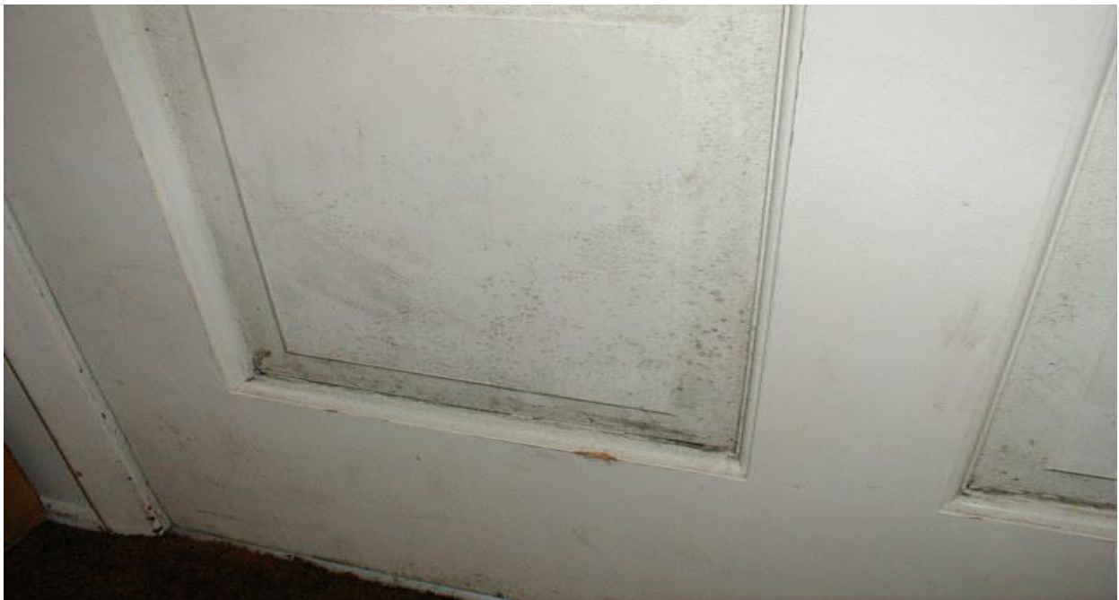
Figure 6. Condensation: Mold growth on inside surface of exterior door. Again, cold surface meets moist air, gets wet and supports mold growth. This can be washed off and repainted.