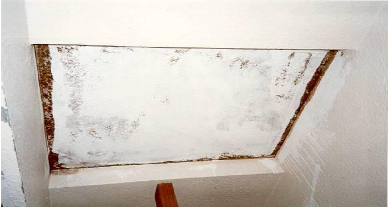
Figure 13. Drywall covered with mold needs to be carefully removed. Painting over mold is not acceptable work practice.

All too often, we see unprotected workers cut out mold-covered drywall that they then haul through the rental to the dumpster with no precautions whatsoever to prevent spores released in the process from contaminating the occupants' belongings.