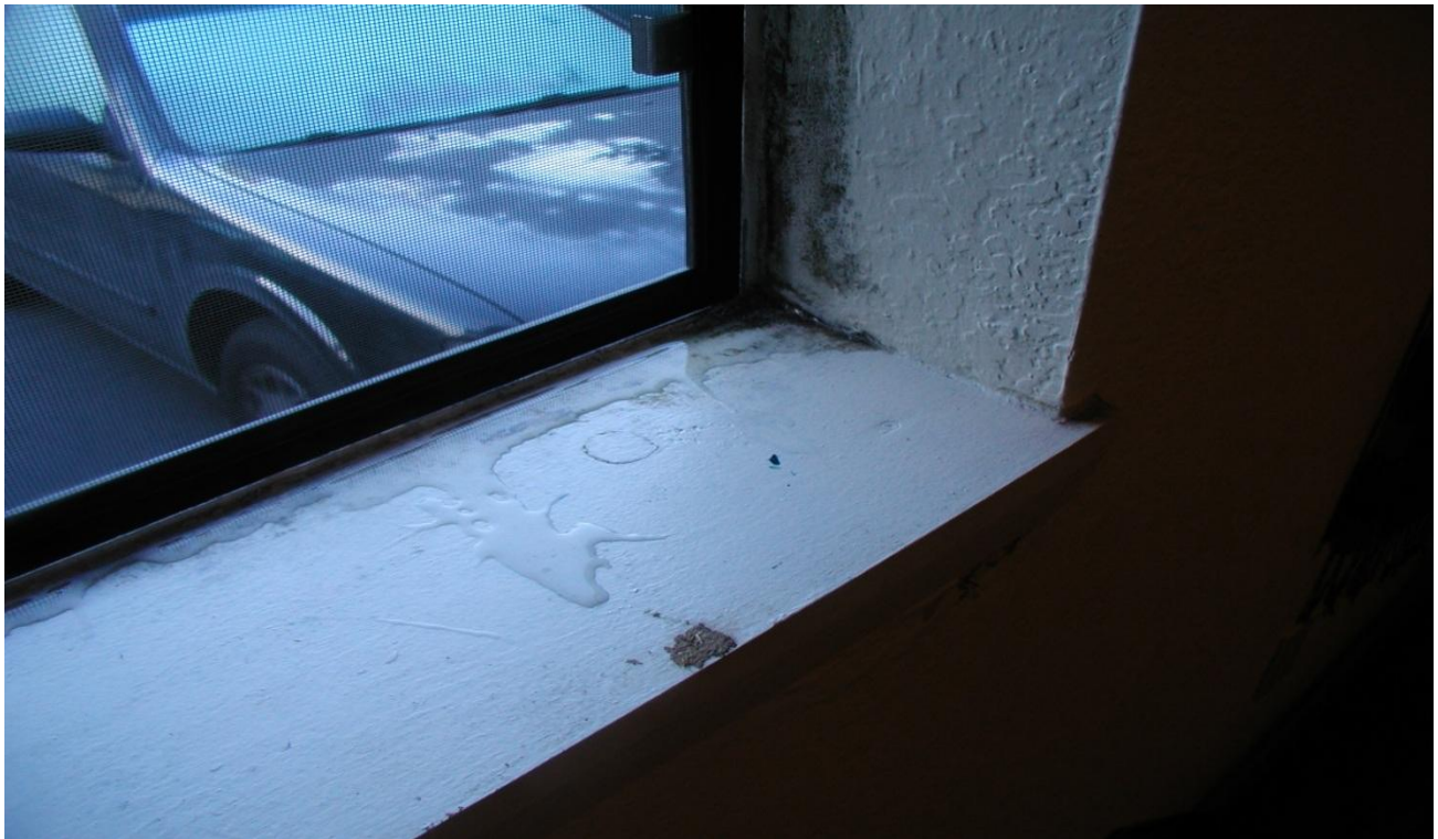
Figure 1. Condensation from excessive indoor moisture on the window glass drained and ponded on the window sill, soaked into and wicked up the drywall, and provided plenty of moisture to cause the black mold growth visible next to the window.

A mold problem always starts as an excess moisture problem. When mold appears, concerned tenants and landlords often “discuss” who is at fault, who should clean it up and how the cleanup should be done. Responsibility for mold growth usually depends on the cause of excess moisture.