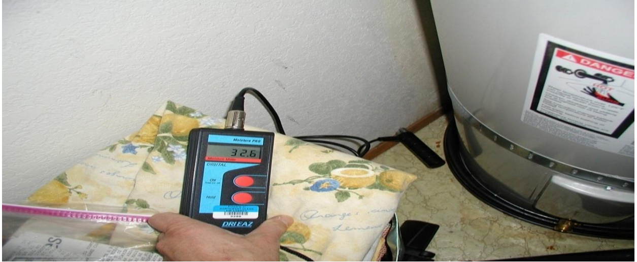
Figure 11. Plumbing leak: Hot water tank leaked and was replaced, but wallboard is still sopping wet (meter says 32.6; 28 is very wet) and mold will grow. This is where a moisture meter comes in very handy; finding damp materials adjacent to a leak before mold grows saves time and money for landlords...the meter may well “pay for itself.” This wet drywall, IF it can be saved, needs to be opened and aggressively dried using professional dehumidification techniques.

A very common mistake made by landlords even after successfully stopping a leak is failing to fully realize the scope of the resulting moisture penetration into building materials (Figure 11) . Typically, drywall, carpet, padding, and subfloors get wet from a bad leak. These materials must be aggressively dried to prevent mold growth, sometimes requiring professional assistance. Carpets may need to be lifted to rapidly dry the carpet, pad, and floor boards using dehumidifiers and fans. Drywall may need some holes drilled through it to get dehumidified air into the wall cavities to get things dry before mold gets started. The alternative, commonly, is mold growth, occupant exposure and property damage that will need more careful repair with mold contamination as a complicating factor (Figure 12).