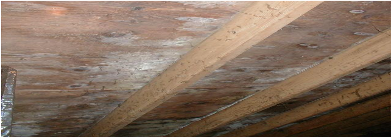
Figure 8. Condensation: Mold growing on roof "sheathing" in an attic. In winter months, moisture (water vapor) leaking through the ceiling of the living area with the force of warm air rising will condense on the cold attic sheathing, causing property damage and mold exposure to occupants. Left uncorrected, the roof will fail and need replacement.

When a crawlspace is as wet as Figure 7, this evaporative water vapor often passes through the house with the force of warm air rising until it reaches the cold underside of roof sheathing and condenses, leading to attic mold growth (Figure 8).