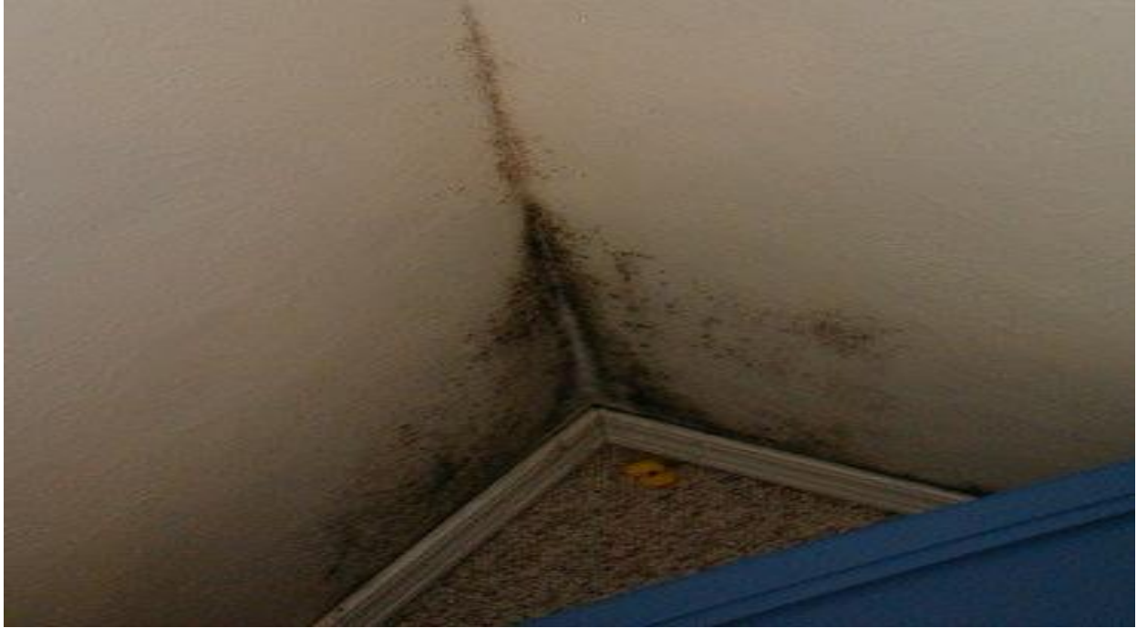
Figure 5. Condensation: Mold growth in bedroom corner of exterior wall. The combination of high relative humidity from occupants breathing all night (exhaling water vapor) and the cool surfaces of the exterior wall led to condensation and mold growth.